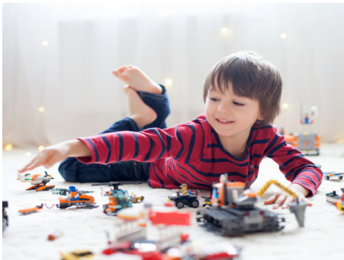
Fun toys and activities will help build your child's confidence and skills across all our key development areas

Weeks are broken into three Skills Days and two Explorer Days, which incorporate indoor and outdoor play, dance, music and yoga.