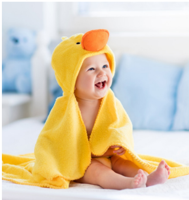
Your child's journey begins at an early age. We'll introduce basic concepts to them in a fun and relaxing way

Our Wandsworth preschool is split into various zones, each one dedicated to a different age group, with specially designed activities. But no matter what part of our school your child explores, they're sure to be inspired by its stunning surroundings.