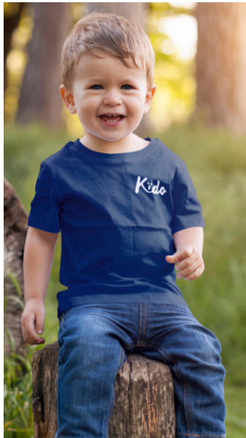
With so many fun activities, our children never get bored of learning

Each and every one of our schools is influenced by the Reggio Emilia method of teaching. Our Wandsworth centre is a beautiful environment designed to inspire children to play and learn from an early age.