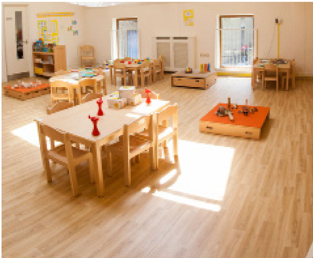
All of our rooms provide enough space for your child to run around and explore