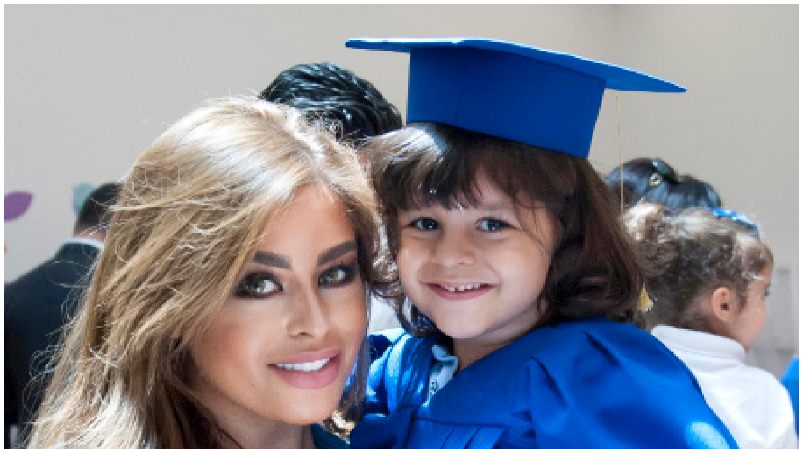
All our schools are dedicated to creating a fantastic experience for children and parents alike