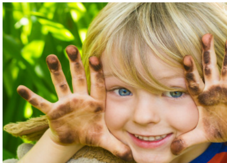
Messy play sessions with mud, water and sand are a fun way for children to develop their fine motor skills

Our Adventurers programme starts as soon as your child can walk and usually finishes by the time they're two years old - though children can move to